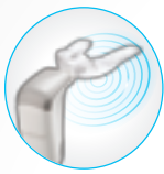
■ AcceleDent Aura

» SoftPulse Technology micropulses are gentle and exert up to 8x less force than a power toothbrush.