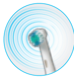
■ Oral-B® Sonic Complete power toothbrush